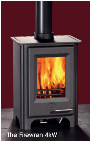
The Firewren 4kW

Metal Developments Ltd reserve the right to change their specifications at any time.