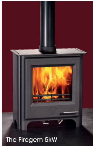
The Firegem 5kW