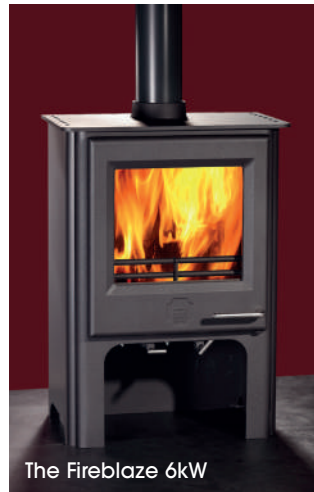
The Fireblaze 6kW