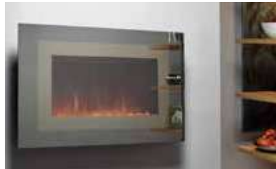
Ayston 515-S Mirror Fascia