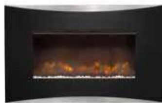
Casterton trim 873