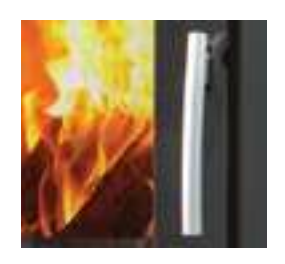
Ergonomically designed handles