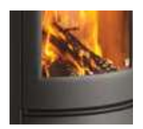
Combustion chamber designed to make it easy to light and clean the stove

The Shape 2 is offered as either a dedicated woodburning or multi-fuel model, and features a tall firebox with a curved window for a breath-taking flame view. These versatile stoves are available in either top or rear flue options and feature Varde's AirBox system for an external air supply if required.