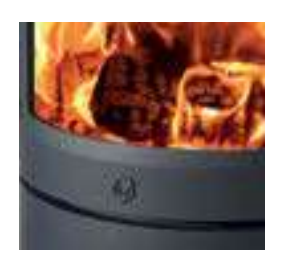
Combustion chamber designed to make it easy to light and clean the stove

Featuring a large curved viewing window and expansive firebox, which can take logs of up to 350mm, the Lincoln woodburning stove offers soaring flame visuals. Producing a generous 7kW high efficiency heat output, this large format stove is suitable for spacious living areas.