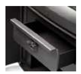
Large capacity ash pan

Aura 1 has a large fire chamber with ample fuel storage space beneath the innovative door which opens when pressed gently.