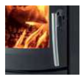
Ergonomically designed handle