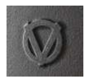
Door, top plate and grate made of high-quality cast iron