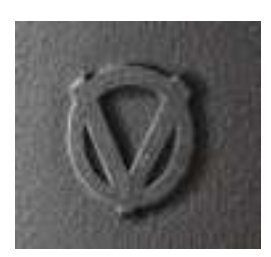
Door, top plate and grate made of high-quality cast iron