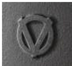
Door, top plate and grate made of high-quality cast iron