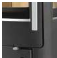
Adjustment of the air supply with one handle