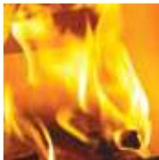
Expansive flame visuals