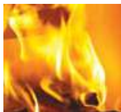
Expansive flame visuals