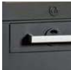
Easy access ash pan