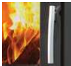
Ergonomically designed handles