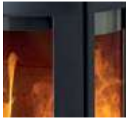
Expansive flame visuals