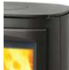
Elegant rounded corners