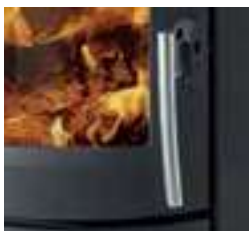
Ergonomically designed handle