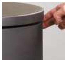
Ergonomically correct adjustment of the air vent