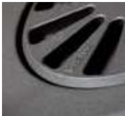
Cast iron disc grate in base for easy ash removal

A perfect balance of form and function, the Samso also features an integral log store and ash draw, with contrasting stainless steel handles to accent the matt black exterior.