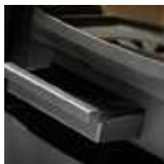
Large capacity ash pan