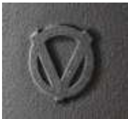
Door, top plate and grate made of high-quality cast iron