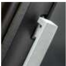
Contrasting handle detail