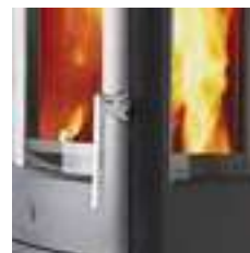
Side windows for an increased flame visual