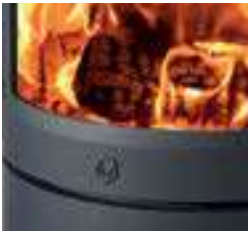
Combustion chamber designed to make it easy to light and clean the stove

The Bolton is a three-sided stove featuring viewing windows on the left and right hand sides of the firebox, which allow its impressive flames to be appreciated wherever you are in the room. Employing a large combustion chamber with powerful airflow systems, the Bolton easily generates an ample heat output of 7kW at an exceptional 80% efficiency.