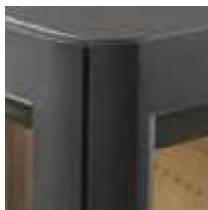
Elegant rounded corners