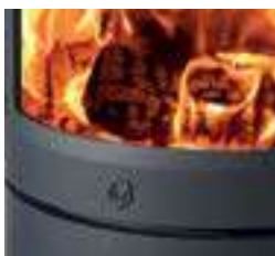
Combustion chamber designed to make it easy to light and clean the stove

Featuring a large curved viewing window and expansive firebox, which can take logs of up to 350mm, the Lincoln woodburning stove offers soaring flame visuals. Producing a generous 7kW high efficiency heat output, this large format stove is suitable for spacious living areas.