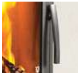
Ergonomically designed handle