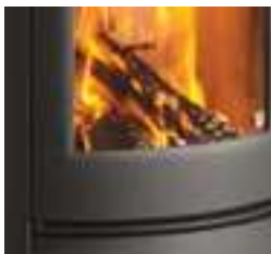
Combustion chamber designed to make it easy to light and clean the stove

The Shape 2 is offered as either a dedicated woodburning or multi-fuel model, and features a tall firebox with a curved window for a breath-taking flame view. These versatile stoves are available in either top or rear flue options and feature Varde's AirBox system for an external air supply if required.