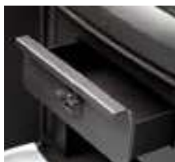
Large capacity ash pan

Aura 1 has a large fire chamber with ample fuel storage space beneath the innovative door which opens when pressed gently.