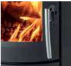
Ergonomically designed handle